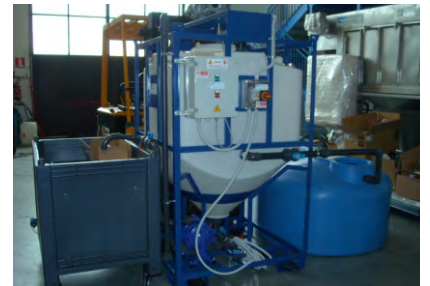
Water & Waste Water Treatment