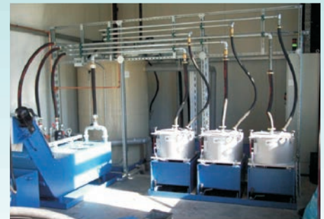
Coolant & Oil Cleaning