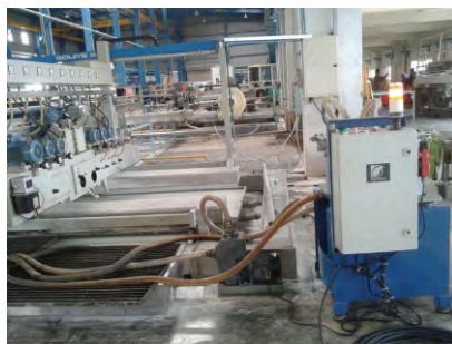
Glass Fines Removal