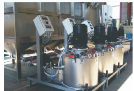
Phosphate Sludge Removal