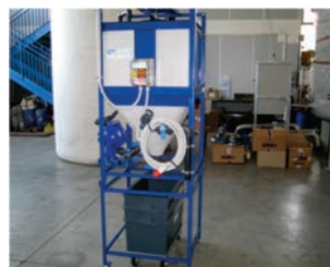
Batch Type Plant