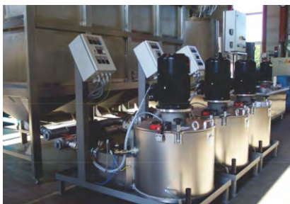
Phosphate Sludge Removal