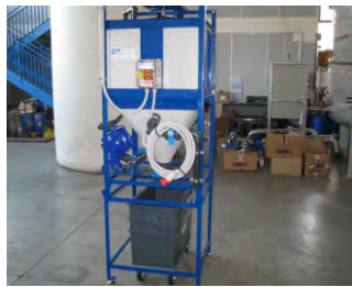
Batch Type Plant