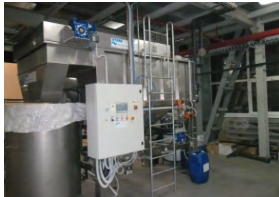
Paint Sludge Removal

HYDRO ITALIA SRL, Italy – for HYDROFLOTY Paint Sludge Removal Systems, Chemicals and Water & Waste Water Treatment Systems