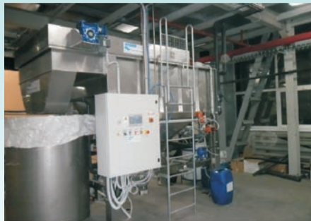
Paint Sludge Dewatering

These world class products have wide applications in: