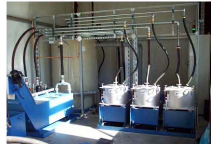
Coolant & Oil Cleaning