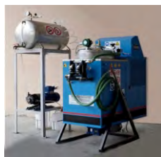
ALPHA 50 MXCA