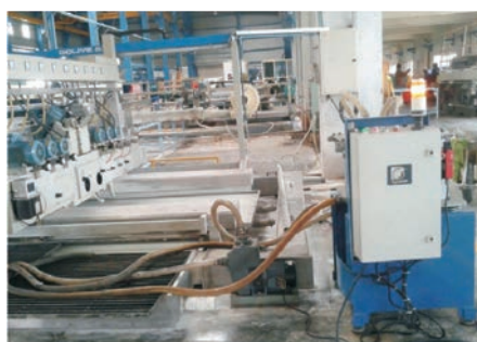
Glass Fines Removal